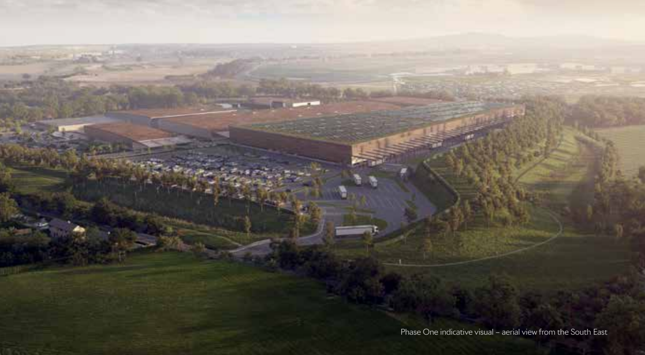
Phase One indicative visual – aerial view from the South East